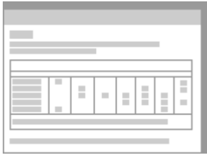
Table 4 - Distribution of various characteristics of women and men INHES participants according to BMI group.

INHES population The prevalence of overweight and obesity was 30.5% and 12.6% in women and 46.7% and 14.5% in men, respectively ( P for gender difference <0.001 ). Table 4 presents the characteristics of INHES participants according to BMI group in a stratified analysis by gender. Similarly to the Moli-sani dataset, both female and male obese were older ( P for both <0.001 ), at lower socioeconomic status and reported a higher intake (grams per day) of pasta in women ( P=0.002 ).